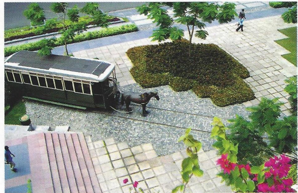
The replica of horse-drawn tram track is accentuated by interesting flooring pattern in local stone